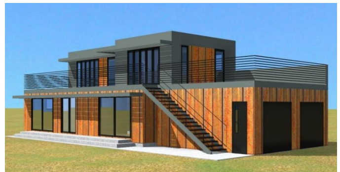
Figure 2. 3D model image of the proposed home

"The Advanced Energy Rebuild (program) helped our family reach our goal of designing and building the most efficient home possible. Funds from this program helped offset (costs for) upgrades in our HVAC system and water heater that would have been extremely difficult to do otherwise. We are proud to say that our home will reach LEED Gold certification for Homes and the AER (program) helped (us) make that a reality."