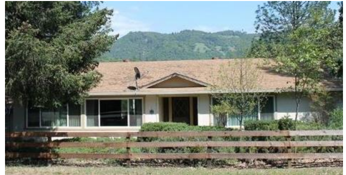
Figure 1. Google street view image of home from June 2012

Located in Redwood Valley, California, the property backs up to the Russian river, creating a serene landscape. The home was affected by the October 2017 Northern California wildfires, and is in the process of rebuilding. This home is designed to be all-electric, which means that no natural gas is being supplied to the home. All mechanical equipment and appliances run fully on electricity.